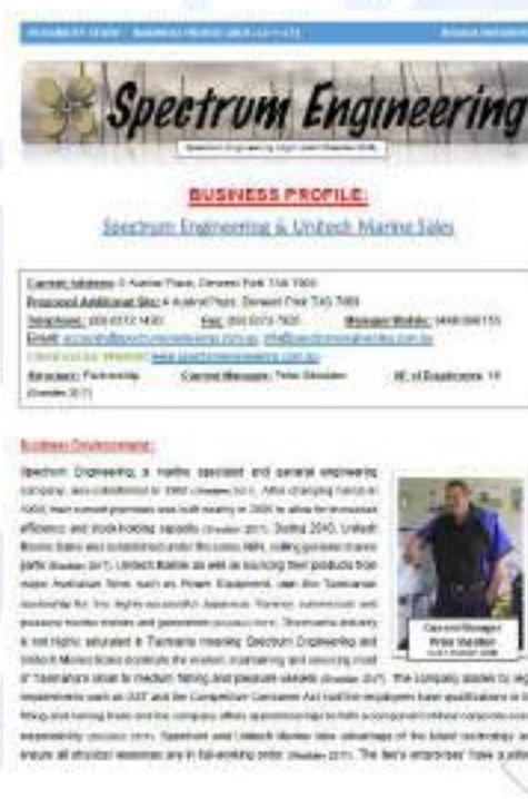
Feasibility Study: Business Profile