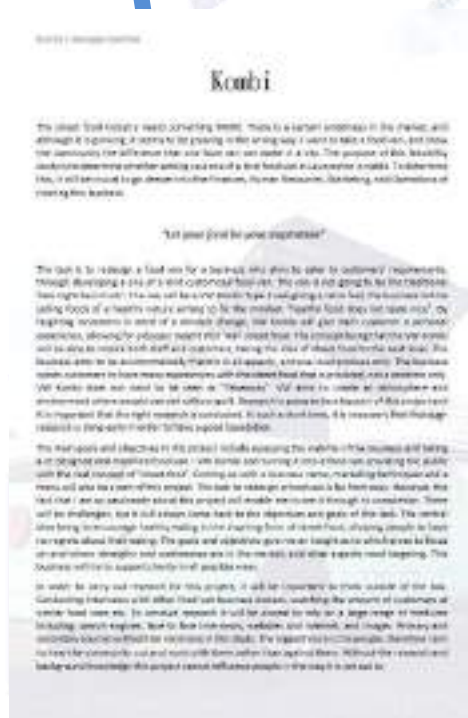
Feasibility Study: Proposal